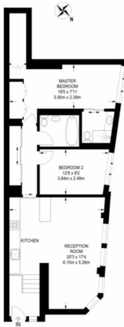
GROUND FLOOR 816 SQ FT / 75.82 SQ M